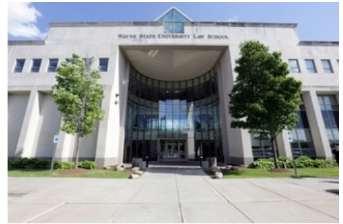
Alumni Dan Gilbert and Stephen Ross donated $5 million each to create the Benson Legacy Fund for Wayne Law and Benson Endowed Enhancement Fund for Wayne Law.

The funds will be used for classroom renovations, new construction, technology enhancements and student and faculty scholarships, among other things. Gilbert, founder and chairman of Detroit-based Quicken Loans Inc. and Rock Ventures LLC , and owner of the Cleveland Cavaliers , received his law degree from WSU in 1987. Ross, chairman of real estate development company The Related Cos. and owner of the Miami Dolphins , received his in 1965.